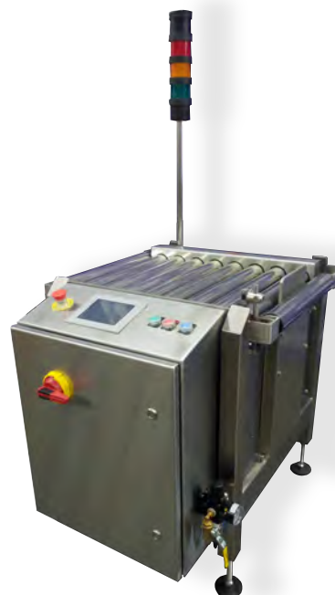
Superweiger CW1 check-weigher.