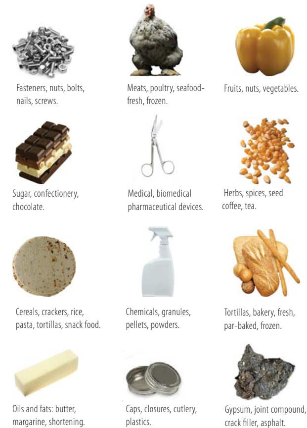
Fasteners, nuts, bolts, nails, screws.