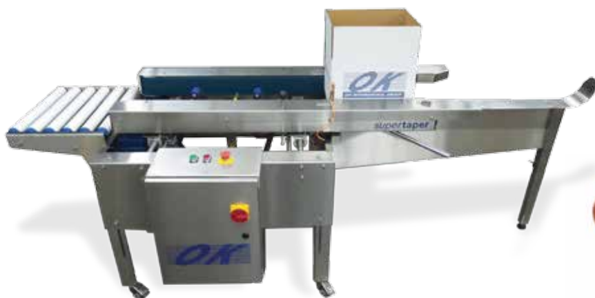
Supertaper ST1X semi automatic case former and bottom taper with automatic case squaring