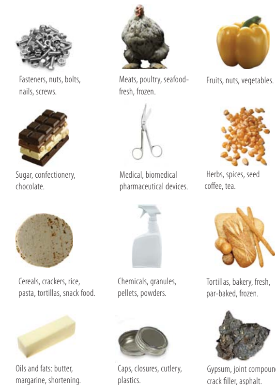
Fasteners, nuts, bolts, nails, screws.